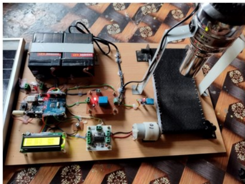
Fig. 3. Hardware model of Smart Solar Seed Dryer using Arduino