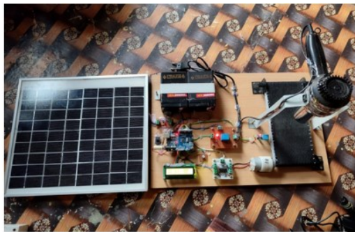
Fig. 2. Hardware model of Smart Solar Seed Dryer using Arduino